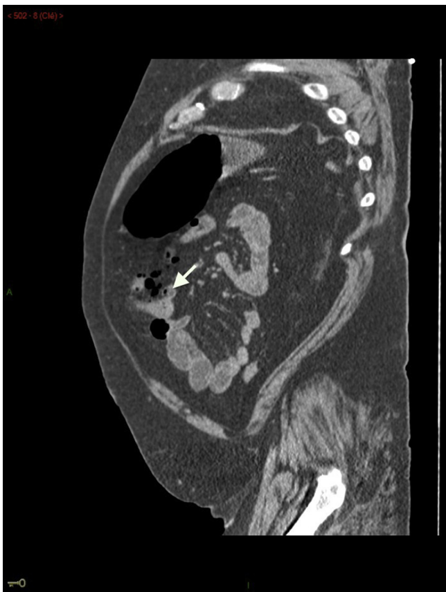
Fig. 1. Abdominal CT scan revealed: multiple diverticula of the small bowel (arrow), thickening of the jejunum due to diverticulitis, and elevation of density of the jejunal mesentery that contained extraluminal air (arrowhead). Findings are suggestive of perforated jejunal diverticulitis.

complaining of generalized abdominal pain, fatigue and altered bowel habits without fever. On physical examination our patient's vital signs were a temperature 37.9 °C, heart rate 105, blood pressure 90/50 and respiratory rate 16 breaths/min. Abdominal examination revealed a generalized abdominal tenderness and signs of peritonitis. Laboratory investigations revealed an elevated white cell count (WCC 16,000 × 10 9 /L). An urgent contrast enhanced CT scan of the abdomen and pelvis showed thickening of the distal jejunal loop and thickening and infiltration of the mesenteric fat and the presence of free air in the mesentery suggesting