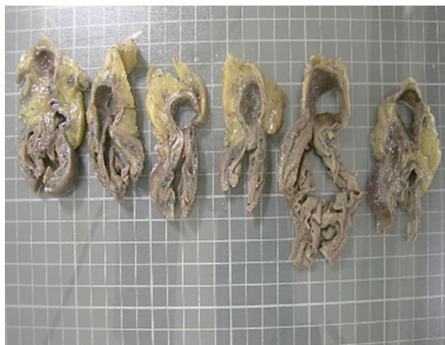
Fig. 2. Small jejunum-ileal diverticulitis.

complaining of generalized abdominal pain, fatigue and altered bowel habits without fever. On physical examination our patient's vital signs were a temperature 37.9 °C, heart rate 105, blood pressure 90/50 and respiratory rate 16 breaths/min. Abdominal examination revealed a generalized abdominal tenderness and signs of peritonitis. Laboratory investigations revealed an elevated white cell count (WCC 16,000 × 10 9 /L). An urgent contrast enhanced CT scan of the abdomen and pelvis showed thickening of the distal jejunal loop and thickening and infiltration of the mesenteric fat and the presence of free air in the mesentery suggesting