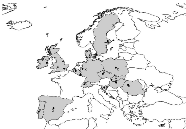
Fig. 1. Map with the urban (●) and rural (X) sampling locations in the 17 European implementing countries of DEMOCOPHES.

The European project DEMOCOPHES (DEMONstration of a study to COordinate and Perform Human biomonitoring on a European Scale) was initiated to demonstrate how harmonized HBM tools developed in the European project COPHES (Consortium to Perform Human biomonitoring in a European Scale) could be applied in Europe to provide baseline information on selected contaminant levels in the European population. Mercury was one of the contaminants included and here we give an insight into mercury levels, based on hair measurements, of children and their mothers in 17 European countries measured under strictly standardized and harmonized conditions (Esteban et al., 2015). Our results build on analysis of total mercury in hair, which is significantly cheaper than analysis of methylmercury. For hair analysis, total mercury is generally accepted as a good proxy for MeHg exposure (Harkins and Susten, 2003).