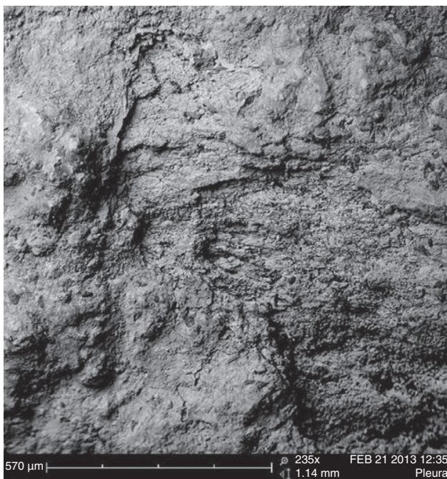
Figure 3 Scanning electronic microscopy of the pleural plaque surface (235 \times ).

Differences in surface roughness and orientation of the mineralizations on external and internal surfaces of the plaques