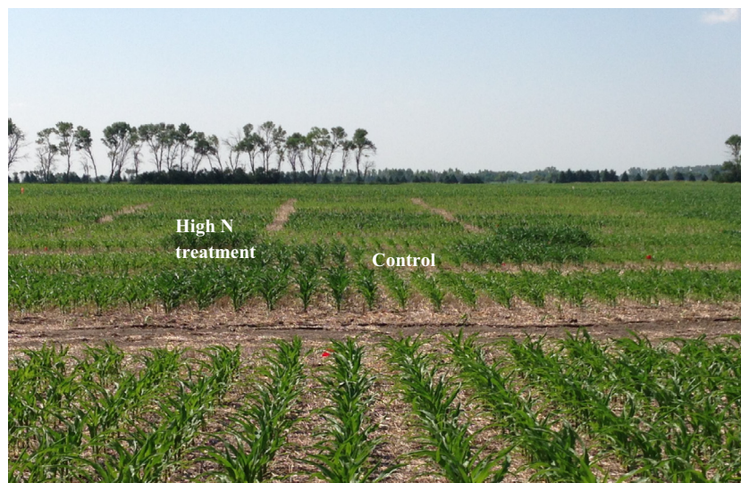
Fig. 3. Visual difference in corn height in control treatment as compared to higher N treatments.

c NA means not available. Corn height was not measured at Richardton and Durbin at V6 due to muddy conditions.