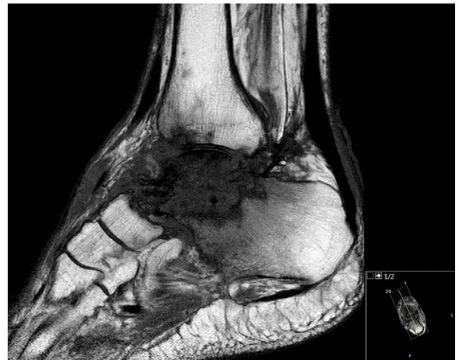
Fig. 4. MRI of the right ankle: the talus appears as a hypo-intense signal suggesting an avascular talus.

ple anastomoses that perfuse the talar neck from the tarsal sinus. In case of a talar trauma with dislocation this blood supply from the talar neck to the talar corpus is interrupted. In such cases the talar corpus is only perfused by the deltoid artery (branching from the posterior tibial artery), enhancing the risk of avascular necrosis [3].