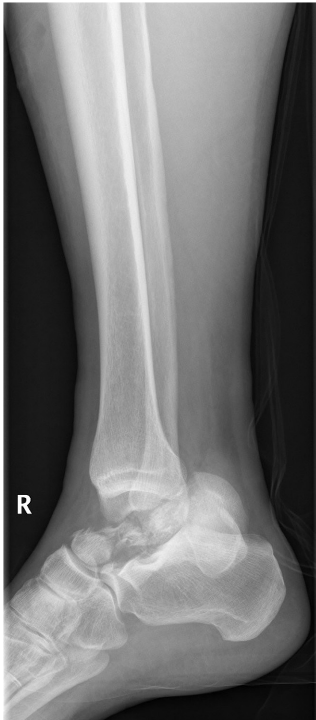
Fig. 3. X-ray of a right ankle: Hawkins IV talar neck fracture with complete dislocation of the corpus.

The high risk of avascular necrosis and arthritis of the talar bone can be explained by the limited vascularisation and the vast articulating surface of the bone. The combination of the rarity of the condition and the fragile vascularisation provide a complex problem. The extra osseous vascularisation consists of three arteries: (1) the posterior tibial artery, which provides blood flow to the deltoid artery and the tarsal tunnel; (2) the anterior tibial artery providing the lateral tarsal artery and; (3) the perforating peroneal arteries providing the tarsal sinus artery. These three arteries form multi-