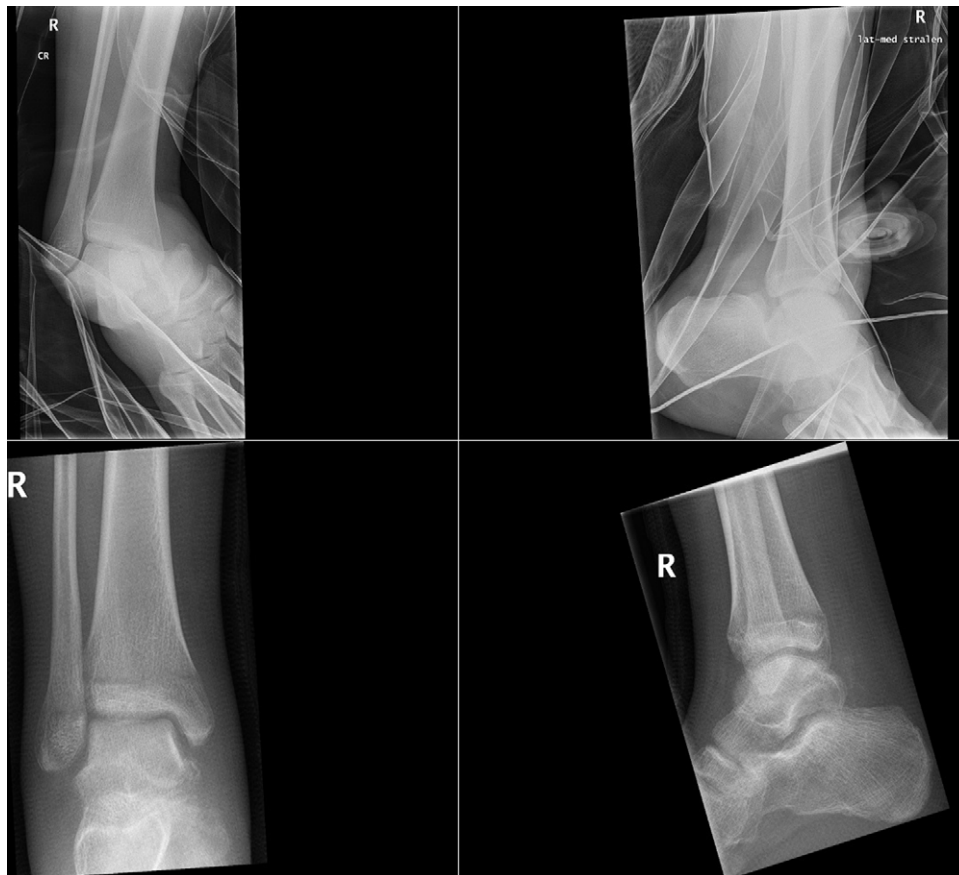
Fig. 1. Top left and right: X-ray of a right ankle in splint. A dislocated fracture of the talus can be seen. Bottom left and right: situation 3 weeks after closed reduction.