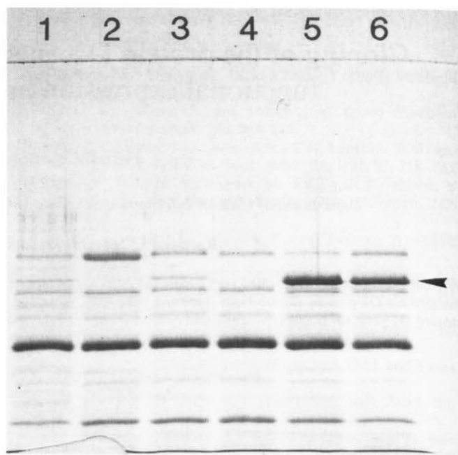
Fig. 2. Electrophoretic analysis of the outer membrane proteins. Purified outer membrane (15 \mu g protein) was subjected to SDS-polyacrylamide gel (10%) electrophoresis. Lane 1, strain PAO2003; lane 2, TNP031; lane 3, TNP033; lane 4, TNP035; lane 5 TNP038; lane 6, TNP040. An arrowhead represents protein D2.

KM. The E. coli transformants harboring the recombinant plasmid (pTN003) expressed a full-sized D2 as judged by the Western blotting analysis of whole cell lysate (data not shown), indicating that there was no Bam HI site in the D2 gene.