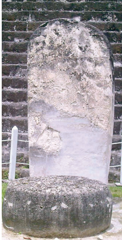
FIGURE 1. Stela with Altar, Tikal (Guatemala)

Especially the carved stelae with the images of rulers and the inscriptions commemorating their deeds must have served as sites of memory which helped to keep royal history alive in the minds of the people. Due to the dynastic nature of ancient Maya rulership, the stelae must have served both as symbols and sources of political power, which confirmed the legitimacy of the ruling lineage. In this context it is noteworthy that in instances of dynastic changes stelae of former rulers were sometimes relocated, damaged, or even used as filling material in the construction of new buildings (Martin and Grube, 2008: 29, 196).