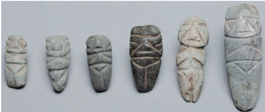
FIGURE 6. Collection of camahuiles

The first example are small anthropomorphic stone images of pre-Hispanic origin, which are frequently found in possession of shamans, who either keep them on their domestic altars or in sacred bundles. In fact only few of these figurines were actually uncovered in archaeological excavations, although a large number of them can be found in museums and private collections all over the world (figure 6). This apparent contradiction is easily explained by the fact that the Maya themselves have collected them for a long time. Consequently the majority of these objects did not remain in the ground but circulated in the communities and were inherited from one generation to the next.