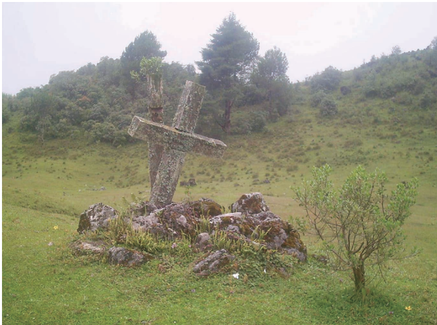
FIGURE 5. Altar in the mountains south of San Mateo Ixtatán

Another parallel between the modern altar and the ancient stela is their relationship to the concepts of time and the calendar. In fact the 260-day calendar survived in different communities in Guatemala into the present and the cycles defined by the numbers 1-13 combined with the 20 Day Lords continue to shape ritual life. For example some altars are dedicated to individual Day Lord and others are just visited on specific dates (Tedlock, 1992; Deuss, 2006). In any event, from the point of view of a modern Maya shaman the sacred landscape of the communities is not only defined in a spacial sense but also in a temporal one with specific dates being linked to specific places. In this context the altars —just like the stelae— can be considered not only as representations but even as embodiments of time itself (figure 5).