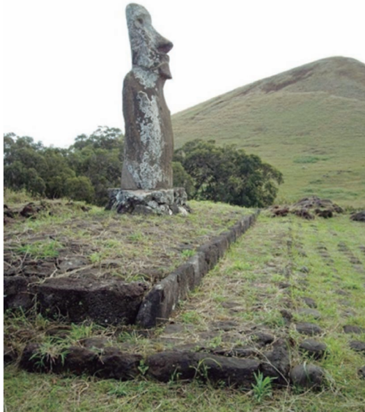
FIGURE 2. Moai on Plattform, Easter Island (Chile)

stones used in the construction symbolized particular ancestors and when a new marea had to be built one of these stones was moved there, to transfer some of its power to the new place (Wallin, 1993). This example of the Polynesian mana might serve us as a useful intercultural comparison with the stela-cult of the Maya. As the example illustrates we should take caution not to be misled by the physical size or the visual attraction of an object when we speculate about its religious importance. In other words, the artistically most impressive image of a ruler on a stela was not necessarily more important in terms of ancestor worship than for example a much smaller and uncarved stone erected for the same purpose. The concept of the mana also illustrates that the spiritual essence supposed to be resting in the stela was not necessarily permanently and entirely bound to one place but could rather be removed or circulated between different places. In fact, such an idea of a person's life force being transferred or connected to different stone objects is documented in both colonial documents and ethnographic descriptions discussed below.