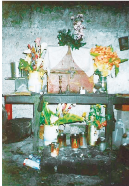
FIGURE 3. Caja real in Todos Santos Cuchumatán (Guatemala)

area. So the entire community started to pray in front of the sacred chest and finally it demonstrated its power: The Guerrilleros in the mountains got scared and paralyzed in terror so that they could easily be killed by the people of San Mateo.