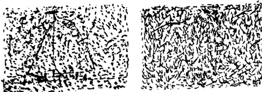
Fig. 1. Examples: the left panel depicts a hidden sailboat; the object has been removed from the picture in the right panel.

When looking at associations between metacognitive parameters and paranoia in the entire sample, the Paranoia Checklist was significantly correlated with knowledge corruption ( r = .17, p = .028 ) and the number of high-confident errors ( r = .18, p = .021 ), while it was inversely correlated with the number of high-confident correct responses ( r = -.28, p < .001 ). The core paranoia subscale score of the Paranoia Checklist was significantly correlated with knowledge corruption ( r = .24, p = .003 ) and the number of high-confident errors ( r = .26, p = .001 ). Again, it was inversely correlated with the number of high-confident correct responses ( r = -.20, p = .01 ). In the OCD group,