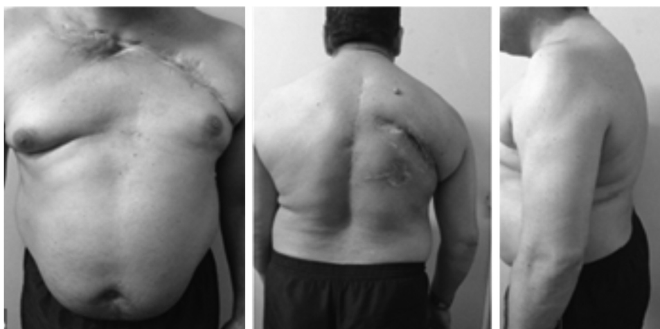
Fig. 5 – Clinical evolution 12 months after the initial diagnosis.

In our case, the upper thoracic region was affected and there was neurological deficit, in contrast to the literature. This