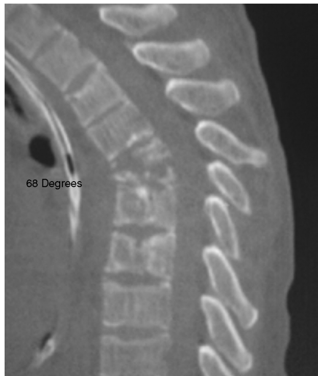
Fig. 3 – Cobb angle in the preoperative period between T2 and T7.

The patient was a 39-year-old homeless, chronic alcoholic male individual. He fell two meters to the ground in October 2012. He was treated in a trauma hospital, where he showed signs of septic shock, hyperemia and crackles in the sternal region, with 10 cm in diameter. Chest radiography and computed tomography (CT) showed pre-sternal subcutaneous emphysema and signs of sternum fracture, and culminated with a diagnosis of anterior chest wall necrotizing fasciitis (Fig. 1). Surgical debridement was performed in this region. The result of the of sternum soft tissue culture was positive for