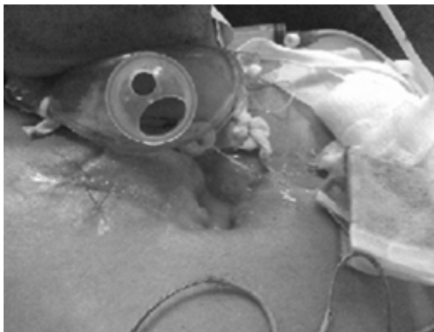
Fig. 1 – Initial aspect of the sternum lesion.