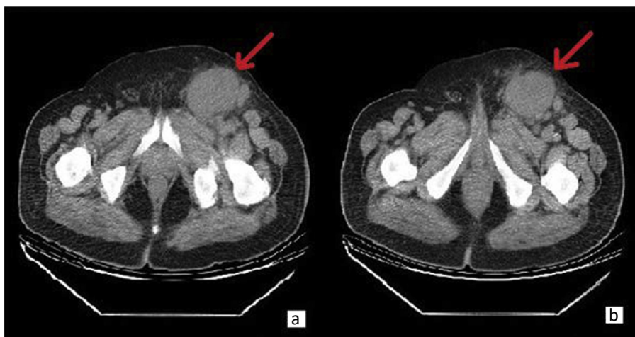
Fig. 2. a–b A well-circumscribed hypodense lesion of 72 \times 55 mm in CT.

The primary factors causing DVT in malignancy patients are mass effect, paraneoplastic effects, and chemotherapy. Upper extremity DVT only comprises 2% of all DVT patients. 9 In hematologic malignancies, particularly after splenectomy, pulmonary embolism and portal vein thrombosis are reported. 10 In a study by Hastaoğlu et al, after a detailed examination of 45 patients presented with