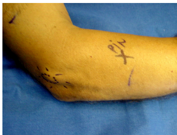
Fig. 2 – Identification of the infiltration site (circled) and the posterior interosseous nerve (PIN).