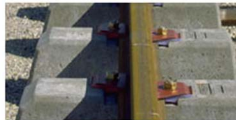
Twin Block Concrete Sleepers