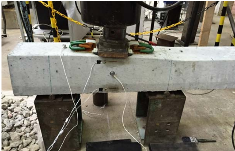
Fig. 2. Arrangement at the rail seat for positive bending test