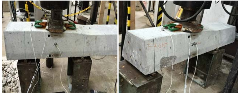
a) sleeper with no web openings before loading

The loading was applied at a moderate rate in order to achieve a displacement-controlled test for more accurate results [13-14]. Therefore, the crack patterns and the growth were visually observed during the testing. At the point when a crack was initially seen at first glance, corresponding load was recorded for every sleeper case. Under flexural mode, the cracks initially occurred at the bottom fibre of the sleeper due to the exceeding of the tensile strength of the concrete and spread towards the top fibre where the compression zone lies. Furthermore, the sudden reduction of the load or moment capacity shown in Fig. 4 illustrates the brittle failure of concrete where the rest of the small changes of the loads are due to steep strand snaps. It was likewise observed that the diameter of the hole does not affect the crack pattern very much. For every sleeper case with different diameters, there is a comparable crack patterns. Therefore, one-before and after-load cracking pattern has been presented for the sleepers with holes and web openings as shown in Fig. 5.