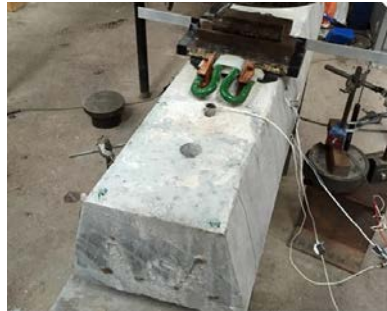
e) Sleeper with vertical hole before loading.