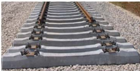
Mono Block Concrete Sleepers