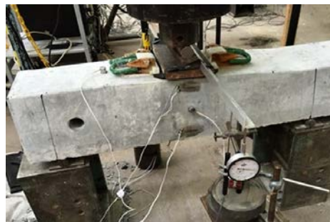
c) Sleeper with transverse hole before loading