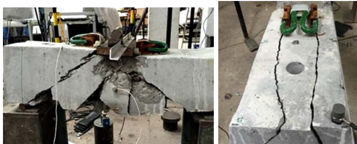
f) Sleeper with vertical hole after loading