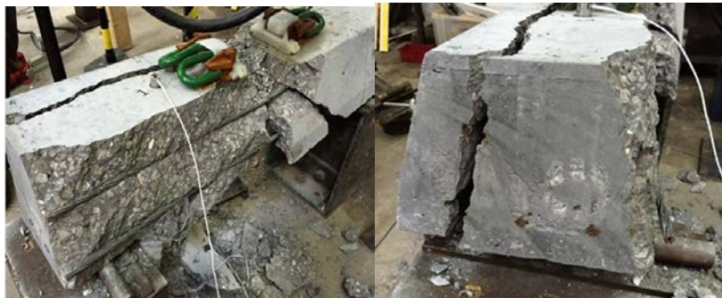
b) Sleeper with no web openings after loading