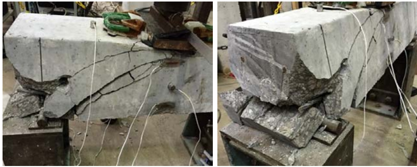
d) Sleeper with transverse hole after loading.