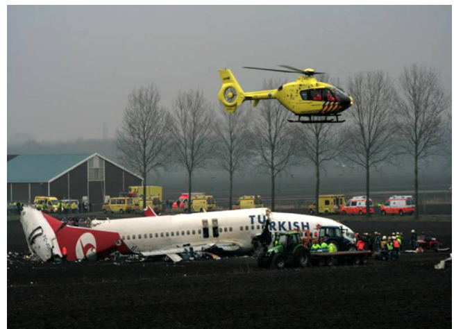
Fig. 2. The scene of the accident.

We compared the triage classifications with 2 clinical outcomes; Injury Severity Score (ISS) and the modified Baxt criteria. 21–23 For the comparison with ISS we analysed how the P1 category correlated with an ISS \geq 16 , P2 with an ISS 9–15, and P3 with an ISS \leq 8 . Second, we used the modified Baxt criteria (from now on