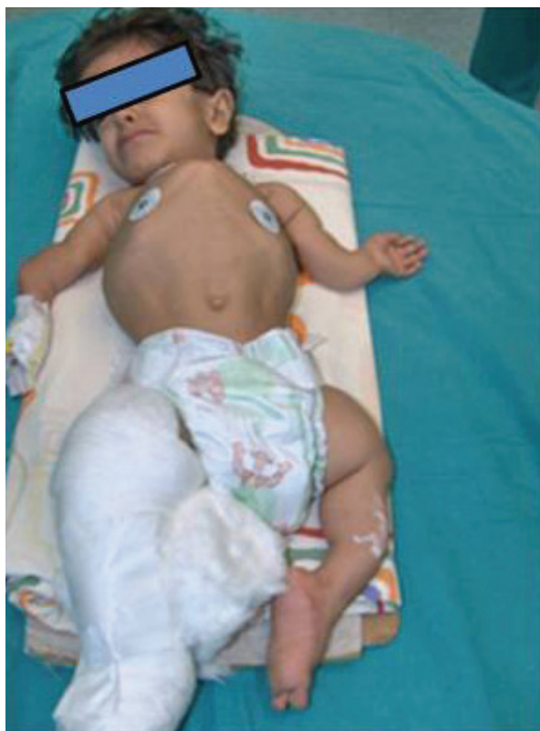
Figure 1 - Photograph of the child with osteogenesis imperfecta prior to monitoring.

Anesthesia was maintained with 50% O 2 and 50% air mixture. We used synchronized intermittent ventilation mode with low tidal volume to avoid chest bone fracture. Esophagus and rectal temperatures ranged between 36-37.1°C during