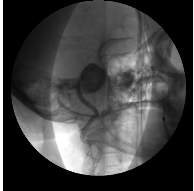
Fig. 3 – An angiogram with selective catheterization of right carotid showing the aneurysm.