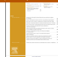
Image in Medicine