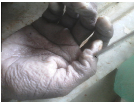
Figure 2 Superficial cut on the right thumb referred as 'cutaneous cut sign' of suicide while engraving letters on the left arm.

suggestive of death due to drowning. Toxicological analysis of the blood revealed ethyl alcohol in the concentration of 88 gm/dl.