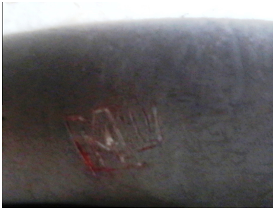
Figure 1 Photograph showing letters 'MILU' engraved with a razor blade on the left arm.