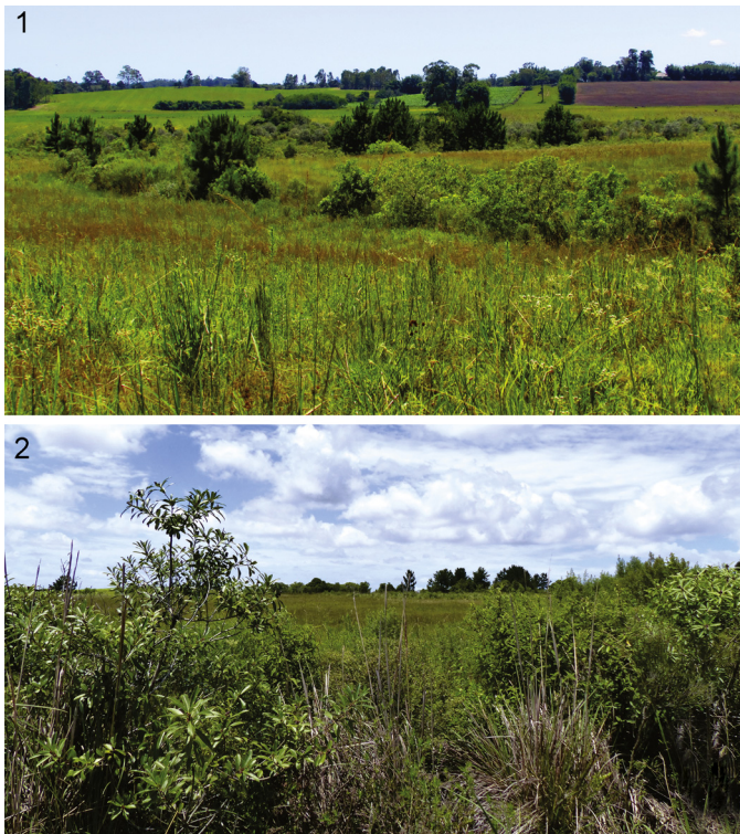
Figs. 1–2. General view of the habitat used by the individuals of Stichelia pelotensis , a stretched area of arboreal vegetation along Embrapa watercourses surrounded by grasslands (1); detailed site in which most individuals of Stichelia pelotensis were observed, including a marshy environment with small trees and shrubs (2).

sites near of Embrapa Clima Temperado Center (Empresa Brasileira de Pesquisa Agropecuária) (31°40'53" S, 52°26'22" W), located in the Monte Bonito district, about 17 km from Pelotas municipality, Rio Grande do Sul, Brazil. The specimens were associated to areas of arboreal vegetation (Fig. 1), flying near the ground, and most of them were observed near a marsh surrounded by grasslands (Fig. 2). The first record was on November 21, 2014, in which a single male was observed at 12:30 h feeding on an inflorescence of Sapium glandulosum . On January 14, 2015, in another nearby place 250 m away from the first one (these two sites are separated by an unpaved road used for car access) four additional males were observed. One male was recorded in the late morning, about 11:30 h, perching on Desmodium incanum DC (Fabaceae) (Fig. 3), and the other three males were seen during the early afternoon from 14:30 h to 14:45 h. The climate was cloudy and muggy, and all individuals were close to each other perching under leaves of the same D. incanum . On January 21, 2015 a male and a female were observed feeding on Eryngium elegans flowers (Fig. 4) from 12:40 h to 12:50 h. Before