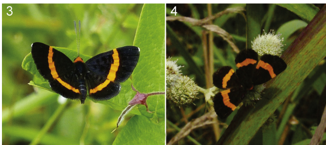
Figs. 3–4. (3) Male of Stichelia pelotensis perching in an individual of Desmodium incanum in the study area; (4) female of Stichelia pelotensis feeding in the inflorescence of an individual of Eryngium elegans in the study area.

sites near of Embrapa Clima Temperado Center (Empresa Brasileira de Pesquisa Agropecuária) (31°40'53" S, 52°26'22" W), located in the Monte Bonito district, about 17 km from Pelotas municipality, Rio Grande do Sul, Brazil. The specimens were associated to areas of arboreal vegetation (Fig. 1), flying near the ground, and most of them were observed near a marsh surrounded by grasslands (Fig. 2). The first record was on November 21, 2014, in which a single male was observed at 12:30 h feeding on an inflorescence of Sapium glandulosum . On January 14, 2015, in another nearby place 250 m away from the first one (these two sites are separated by an unpaved road used for car access) four additional males were observed. One male was recorded in the late morning, about 11:30 h, perching on Desmodium incanum DC (Fabaceae) (Fig. 3), and the other three males were seen during the early afternoon from 14:30 h to 14:45 h. The climate was cloudy and muggy, and all individuals were close to each other perching under leaves of the same D. incanum . On January 21, 2015 a male and a female were observed feeding on Eryngium elegans flowers (Fig. 4) from 12:40 h to 12:50 h. Before