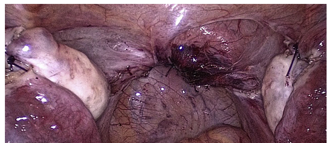
Fig. 2. Laparoscopic view after vault closure.

Postoperatively, patients were covered with intravenous cefazolin and gentamicin for 1 day followed by 1 week of oral cefadroxil. They were started on graduated feedings to a soft diet on the 1 st day and encouraged to ambulate. The cylindrical vaginal stent and bladder catheter were kept in situ and removed on the 3 rd postoperative day. The patients were then monitored for 1–2 more days to assess wound healing and any complications after vaginal mold removal. They were discharged on the 4 th or 5 th postoperative day. Prior to discharge they were taught how to use a vaginal dilator and were given bacitracin ointment and premarin cream twice a day for vaginal application for 2 weeks. The vaginal mold is used