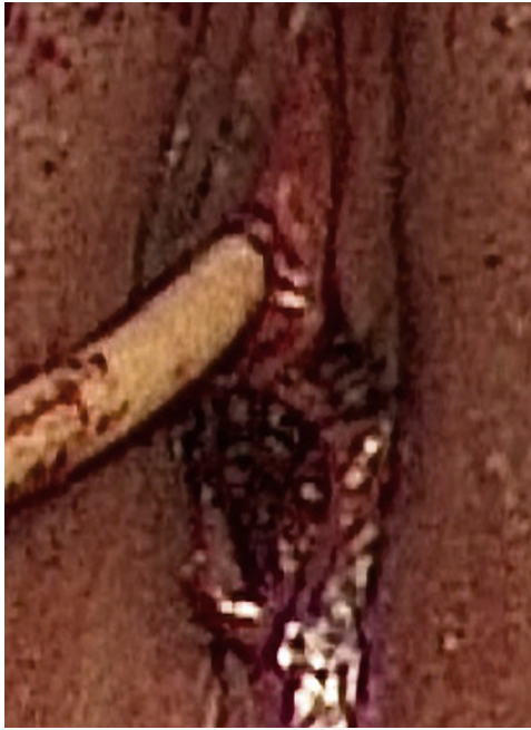
Fig. 3. Vaginal view at the conclusion of surgery.