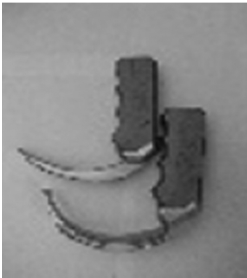
Figure 2 Figure showing the conventional CMAC blade and the D-blade CMAC videolaryngoscope.

an inbuilt pronounced angulation (Fig. 2). This increase in angulation from 18° in CMAC (size 3) to 40° in the D blade CMAC necessitates the use of a curved stylet and results in greater manipulation in negotiating the tube through the vocal cords.