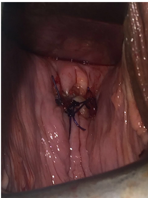
Fig. 2. Shortly after repair of VCD with interrupted No. 2-0 monofilament synthetic absorbable suture.

LigaSure vessel sealing system was ultimately used to cut paracervical ligaments. Subsequently, only a unipolar hook was used to cut the vaginal cuff in both the cutting and coagulation modes. In addition to the common use of electrocautery laparoscopic colpotomy, the magnification view may also cause suture bites to be smaller than desired [9].