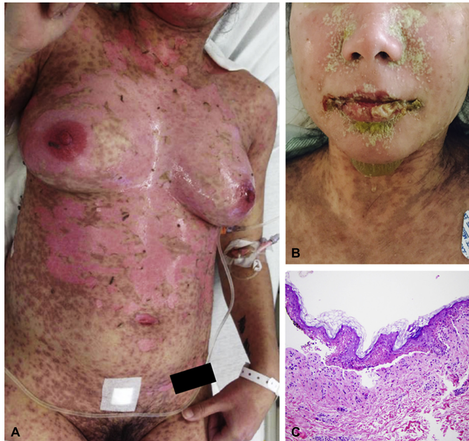
Fig 1. A and B , A 28-year-old woman on presentation with greater than 30% body surface area of full-thickness erosions and flaccid bullae on the face, trunk, extremities, and mucosal surfaces including the eyes, mouth, and groin. C , Hematoxylin-eosin–stained biopsy from the lower abdomen with vacuolar interface dermatitis, prominent keratinocyte necrosis, and preservation of the cornified layer consistent with TEN.

that precluded further digital and speculum examinations (Fig 2, A and B).