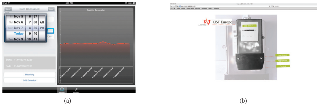
Figure 2. (a) Application implemented in an iPad, (b) Implemented Web application