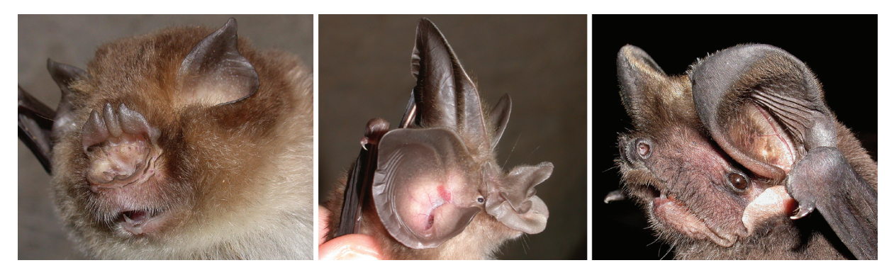
Figure 1. Natural selection shapes the faces of echolocating bats into bizarre forms.

The ears of echolocating bats are enlarged for the detection of faint echoes, and the noses of species that send sounds through their nostrils may become surrounded by elaborate noseleaves that focus the sound. These features are illustrated in bats from China, from left to right: Aselliscus stoliczkanus , Rhinolophus paradoxolophus and Tadarida teniotis .