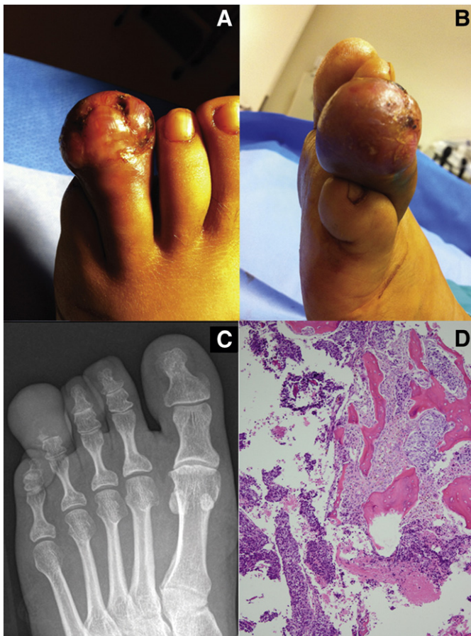
Fig. 1. Images of cervical cancer toe metastasis in Case 1. A) Dorsum of left fourth toe, notable for profuse swelling, erythema, and necrosis of the distal phalanx. B) Lateral view of the same toe. C) Plain film of the left foot, showing soft tissue swelling with erosion and resorption of the fourth distal phalanx. D) Hematoxylin and eosin staining of the toe following amputation, showing nests of metastatic squamous carcinoma, with necrosis, in a fibrous stroma, infiltrating the marrow space of the distal phalanx.

CT revealed progressive lung, liver and spleen metastases. She expired seven months after initial diagnosis of cervical cancer, and two months after presenting with toe metastasis.