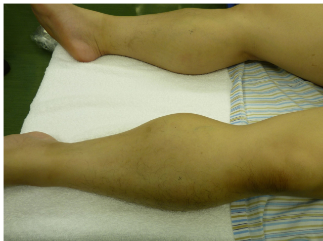
Fig. 1. One hour postoperatively, the patient complained of severe cramping-type pain, swelling and serious tenderness on palpation in both legs.

Compartment syndrome is a well-known abnormal injury. However, it remains not widely known that compartment syndrome develops not from injury, but as a result of "abnormal" positioning of the limbs. Since the calf compartments are the most commonly affected, the term WLCS is used to describe this syndrome [1]. The overall incidence of WLCS in patients after major pelvic surgery in the lithotomy position is estimated to be 1 in 3500 cases [2]. The lower limb consists of four main compartments: the anterior, lateral, superficial and deep posterior compartments. These regions are bordered by strong, inelastic fascial layers or bone, and through each run neurovascular structures [3]. WLCS is caused by pathological elevation of the intra-compartmental pressure within the non-expansile tissue envelope [4]. A reduction in the blood perfusion pressure causes tissue ischemia. Ischemia may be followed by reperfusion with subsequent capillary leakage and