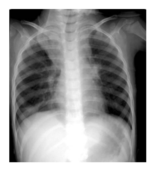
Figure 1. Chest X-ray shows right upper lobe atelectasis and mild opacity in the right lower lung, suggesting a possible infectious process.

Laboratory data revealed elevated C-reactive protein (29.1 mg/L) and leukocytosis (white blood cells, 17,900/ \mu L; Seg/Lym, 83%/12%). FTB was performed immediately. Severe stenosis of the orifice of the right upper lobe bronchus was detected, which did not allow the 2.0-mm bronchoscope to pass. There was no foreign body or structural anomaly noted in the bronchi. Due to suspected bacterial pneumonia and asthma attack, the patient was given empiric antibiotic therapy with ampicillin/sulbactam (150 mg/kg every 6 hours), bronchodilators, and an inhaled steroid. However, the wheezing persisted and was refractory to bronchodilators. MDCT was performed and revealed narrowing of the orifice of the right upper lobe bronchus, relative to the diameter of the remainder of