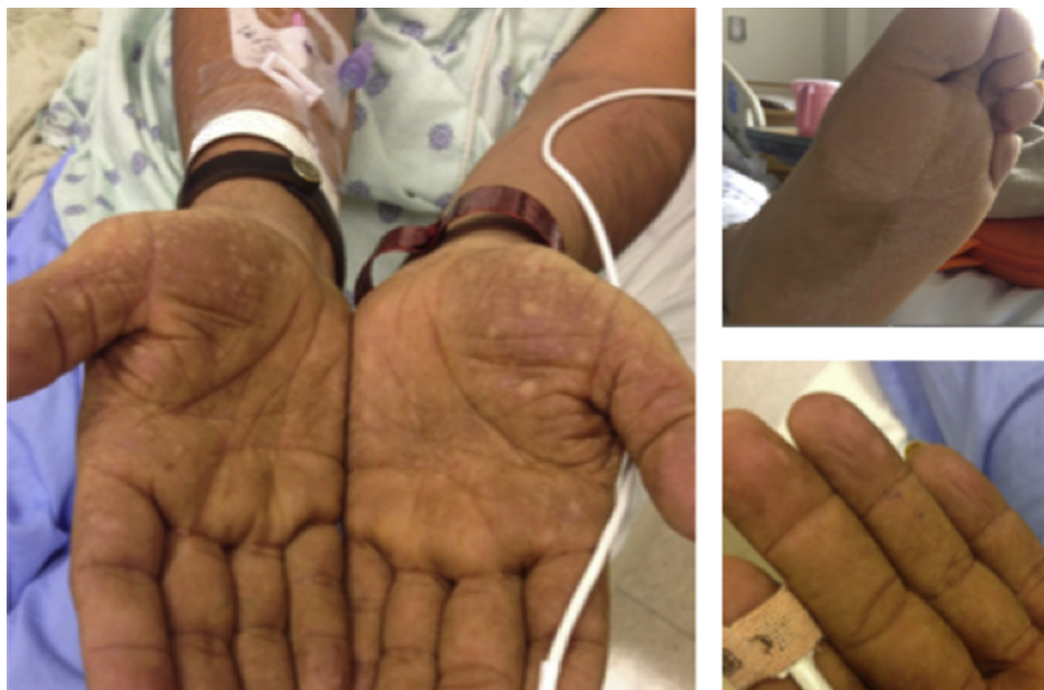
Fig 1. Initial physical examination. Bilateral palms and plantar feet show significant rugose thickening and brownish-yellow hyperpigmentation.