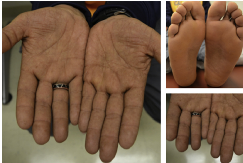
Fig 3. Decreased thickening and rugosity of bilateral palms and feet after immunosuppressive therapy and pulmonary transplant.

prednisone. Furthermore, within weeks of treatment with mycophenolate mofetil and lung transplantation, there was marked improvement in both the rough texture and thickness of his palms.