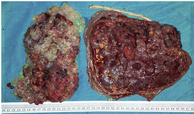
Fig. 2. Gross appearance of the hydatidiform mole (left) with grape-like tissue and another normal placenta with umbilical cord (right).

(310277.7 mIU/mL) detected at the maternal serum screening for Down's syndrome. An ultrasound scan showed a normal fetus and a coexisting, but separate, soft tissue mass with multiple cystic spaces in the uterine fundus, measuring 7.5 cm × 6.8 cm × 5.4 cm (Fig. 1). Amniocentesis for fetal karyotyping revealed 46XY. There was no episode of vaginal bleeding nor evidence of hypertension