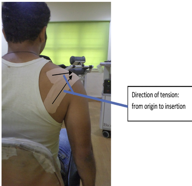
Figure 2. Application of tape and direction of tension.

the muscle. To attain this, the tape was stretched out to its maximal tension then subjectively backed off halfway as it was put along the course of the muscle and over the insertion on the greater tubercle (Fig. 2). No stretch was applied to anchor the tape. The tape was rubbed briefly to adhere to the skin. The same tape application technique was then