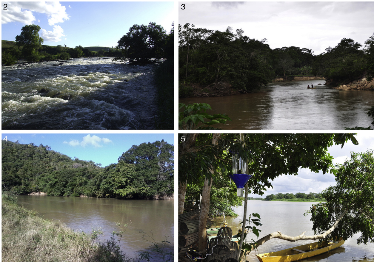
Figs. 2–5. Some of collection points. 2. Cotaxé River, Patrimônio do Bis. 3. Cricaré River, Fazenda Liberdade. 4. São Mateus River, Sítio Santa Maria. 5. São Mateus River, Guriri.