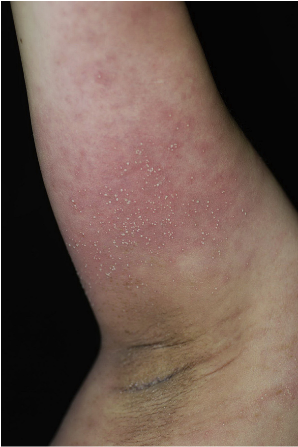
Figure 1 Multiple diffuse erythematous maculopatches studded with several pinpoint, non-follicular pustules with accentuation on the flexural areas in a 34-year-old female patient with drug-induced AGEP.

drugs, especially antibiotics such as aminopenicillin and macrolides. 6 In this study, we reviewed the clinical and laboratory characteristics of 51 patients with AGEP admitted to the Chang Gung Memorial Hospital between 1992 and 2012, to determine the causes of AGEP in a Taiwanese population.