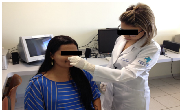
Figure 1 Performing the Test of Hypernasality.

The final test score considers the number of words for which the evaluator heard the noticeable change in resonance. Scores may range from 0 to 10, indicating that there was no variation in the resonance of any of the pairs of the 10 words, to 10–10, indicating resonance variation in all pairs (Fig. 1).