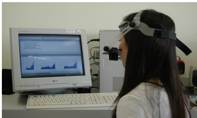
Figure 2 Patient undergoing nasometry.

The results of sensitivity, specificity and overall nasometer efficiency indices were 62%, 87% and 76%, respectively.