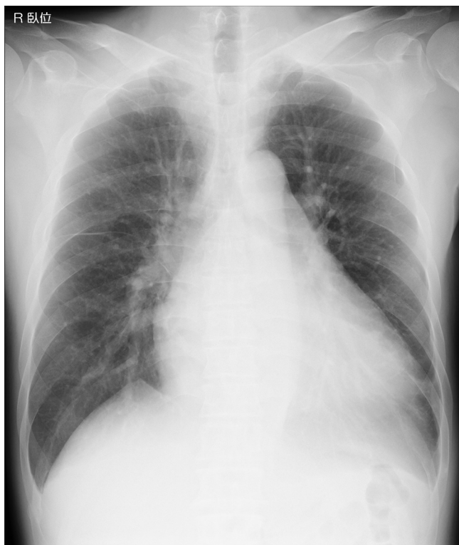
Fig. 1. An initial portable chest radiograph postoperatively showed right-sided patchy opacities and interstitial infiltrates.