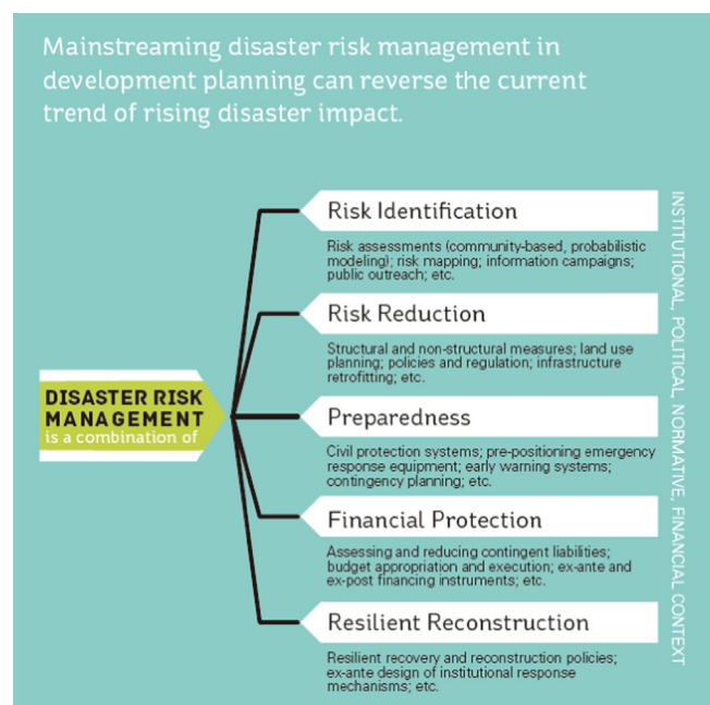
Fig. 1. World Bank's disaster risk management framework.

Instituting proactive drought preparedness and risk management approaches can purportedly pay dividends in the form of more resilient water systems and communities, fewer economic losses, and improved disaster response and recovery. Through drought preparedness efforts, as facilitated by national and state drought policies and planning mechanisms (Sivakumar, 2011; Wilhite, 2011; UNCCD, FAO, and WMO, 2012a, 2012b), the