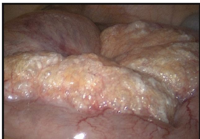
Fig. 3. Viable small bowel.

laparoscopy to identify the extent of any pathology. The patient made an informed decision to proceed with this.