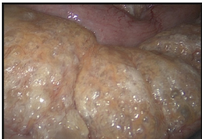
Fig. 2. Small bowel mesentery showing extensive gas infiltration.