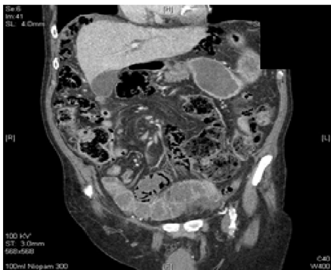
Fig. 1. CT imaging reveals gross mesenteric air.