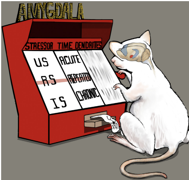
Fig. 1. Stress as a one-armed bandit: differential effects of stress paradigms on amygdalar morphology. While stress paradigms consistently elicit atrophy of neurons in the rodent hippocampus and medial prefrontal cortex (blue highlighted regions in rat brain), stress-induced morphological changes are more heterogeneous in the amygdala (red highlighted region). The factors that impact morphological parameters include the type of stressor performed (US: unpredictable stress; RS: restraint stress; IS: immobilization stress), as well as time (i.e. duration) of the stress paradigm (acute versus chronic versus repeated). As described, the outcome on dendritic morphology depends on the combination of stressor, time, age and sex of the rodent. See text for details.

McEwen et al., 2010). More recently, we reported that the antidepressant agomelatine, a melatonergic receptor agonist and 5HT 2C receptor antagonist, effectively prevents repeated restraint stress-induced dendritic atrophy of BLA pyramidal neurons (Grillo et al., 2015).