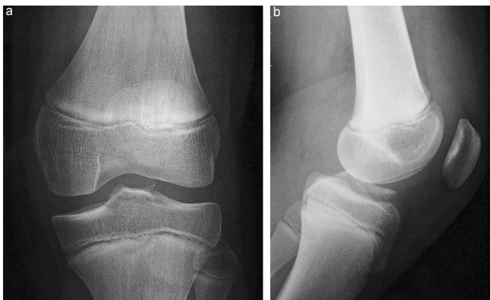
Figure 2 AP (2a) and lateral (2b) pre-operative X-ray of type-II tibial eminence fracture; 12 year-old boy.

100, 100 representing maximal everyday and sports activity without restriction or symptom. The 13 patients seen for arthrometry were assessed by two examiners, external to the hospital in which the children had been operated on, so as to optimize objectivity. Table 2 presents data for this subpopulation. All 13 patients completed the subjective IKDC [9] and ARPEGE [12] questionnaires. Physiotherapeutic assessment was performed on both knees with manual testing to assess laxity and mobility and complete the IKDC clinical checklist. Mean anterior ligament laxity was calculated from the KT 1000® data and compared between knees. Ipsilateral quadriceps force was measured in kg using a dynamometer and expressed as a percentage of the contralateral (healthy) value.