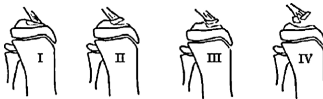
Figure 1 Fracture classification according to Meyers and McKeever as modified by Zaricznyj.

All patients were scheduled for follow-up, but seven were lost and one was excluded from analysis as having less than two years' follow-up. Thirteen patients agreed to come for KT 1000 ® (MEDmetric ® Corp.) arthrometry. Ten declined but agreed to complete the International Knee Documentation Committee (IKDC) subjective questionnaire [9], comprising 18 items (symptoms, level of activity, overall knee function) and giving a score between nine and