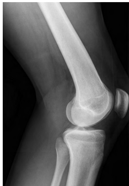
Figure 3 Lateral X-ray at the longest follow-up: age 18 years (i.e., 6 yrs FU).

The first comprised two type-II fractures and the two type-IV, and showed good recovery despite objective IKDC ratings of B or C, inasmuch as the subjective ARPEGE and IKDC assessments testified to sports activity and virtually unrestricted everyday activity. The patients judged their knees stable and resistant to effort, complaining simply of some moderate pain during sport.