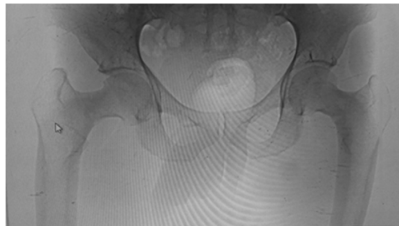
Fig. 1 – Panoramic anteroposterior radiograph of the pelvis disclosing bilateral cortical interruption of the femoral neck.

Male patient, 43, electrician, non-athlete, smoker, with no history of metabolic disease, diabetes, impaired renal function, or use of corticosteroids. He reported pain in both hips for a year when in professional activity, which reduced at rest. During this period, he was seen in various outpatient clinics and diagnosed with tendinitis or pain due to overload of the hip joint, and was treated with non-steroidal anti-inflammatory drugs. Physical examination revealed discrete limping with painful facies, functional impairment, especially in internal rotation. Radiographic examination showed a bilateral coxa vara with cortical interruption and a sclerotic area in both femoral necks (Fig. 1). CT scan confirmed the diagnosis and narrow femoral necks were observed (Fig. 2). As the diagnosis