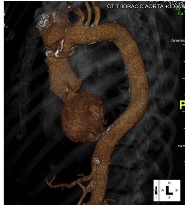
Figure 2. 3D reconstruction of contrast-enhanced CT illustrating the relationship of the ascending aortic aneurysm to the great vessels and coronary ostia.

Three days later, TEVAR was successfully reattempted using a Medtronic Valiant stent graft (40 mm × 40 mm × 100 mm, catheter length 85 cm) (Medtronic, Dublin, Ireland). This was