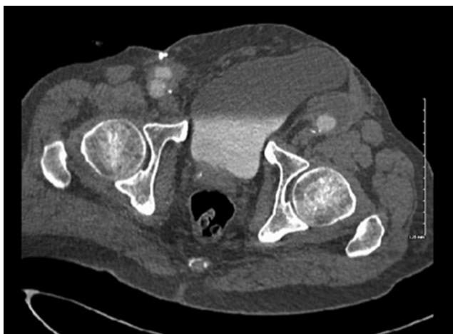
Figure 4. Contrast-enhanced CT illustrating fluid around the left limb of the previous aortobifemoral graft.