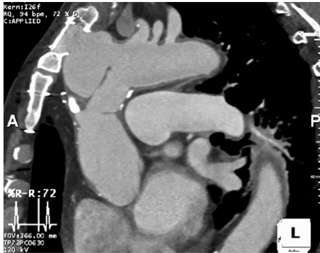
Figure 1. Pre-operative contrast-enhanced CT scan of the ascending aortic pseudoaneurysm.

multiple challenges to fix this by endovascular repair. The pseudoaneurysm started immediately proximal to the innominate artery, indicating that a sealing zone would require coverage of both the innominate artery and the left common carotid artery with its take off just 2 mm from the innominate artery. Furthermore, the thoracic stent would need to be short enough to lie distal to the coronary sinus and proximal to the left subclavian artery. This distance was measured to be 100 mm. The aorta above the aortic valve measured 36 mm while the distal landing zone at the left subclavian was only 25 mm in diameter, indicating that a tapered graft would be preferred. The relationship of the pseudoaneurysm to the great vessels and coronary ostia is illustrated in Fig. 2 .