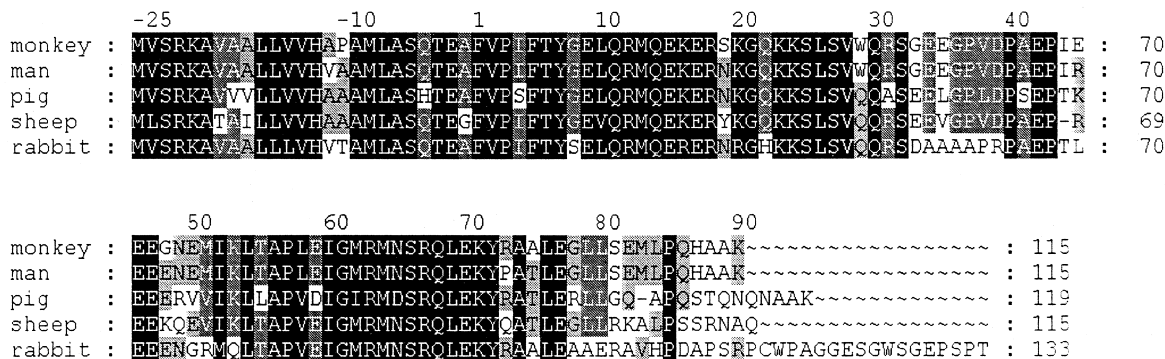
Fig. 2. Multiple alignment of motilin precursor from several species. The most conserved region between species is indicated in dark background. Amino acids are numbered relative to the motilin peptide start site.

respectively. The cDNA sequences were confirmed by six independent sequences from six different PCR products. All gave identical results and the complete nucleotide sequence of the cDNA encoding the monkey motilin precursor is given in Fig. 1.