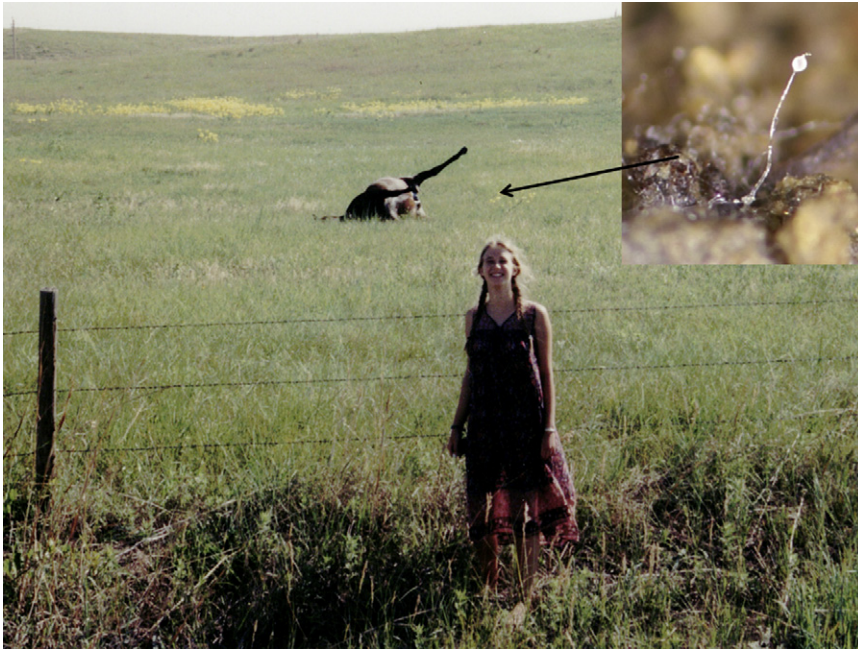
Figure 2. What is an organism?

The human is clearly an organism. The horse was an organism. But what about the bacteria now growing in the horse, the slime mould fruiting body on the horse's faeces, or the clumps of plants growing in the background? (Photos provided by Marshall Burke and Owen Gilbert.)