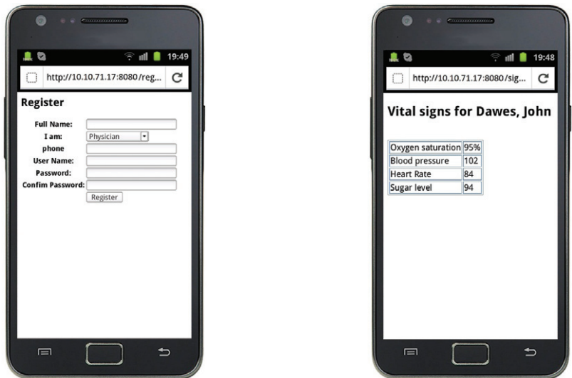
(a) User (ex. physician) registration form to access patient's data: the request would be awaiting for approval by the patient before the user is able to access data