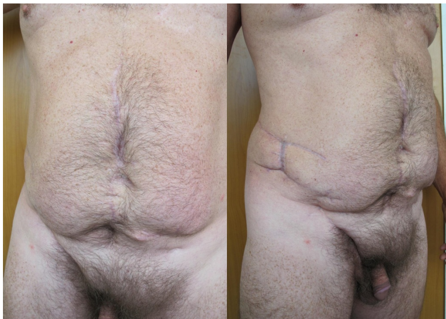
Figure 1 Postoperative view of Fournier's gangrene and necrotizing fasciitis of the abdominal wall with closed divergent colostomy.

NF of the AW and RS, even today, presents a challenging surgical issue. Skin incision must be performed in the longitudinal direction along the muscle-fascial layers of the inner AW until healthy fascia adherent to the overlying subcutaneous tissue and muscle is encountered. It is not indicated to perform two, three or more parallel incisions or any perpendicular incisions, because the bridges of skin and skin islands will usually not survive. Postoperative wound management on the AW consists of serial dressing changes during the next 24 h to 48 h, until the wound is free of recurrent or ongoing infection. When infection progresses across the deep fascial plane of the AW or a necrotic area on the skin appears, aggressive surgical debridement should be repeated. In our case with NF of the AW and RS we usually performed two to five debridement procedures to stabilize the wound conditions. The primary defect on the AW is usually large and it is repaired with advancement flaps using an abdominoplasty technique,