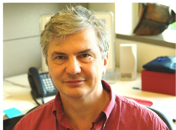
Figure 2 A port trait of Napoleone Ferrara.

generated an intense blue spot due to extravasated Evans blue, and called this activity VPF [16]. VPF showed a potency some 50,000 times that of histamine [17,18]. The molecular cloning of VEGF and VPF revealed that both activities are embodied in the same molecule.