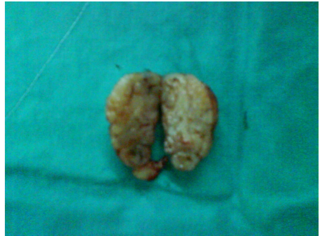
Figure 2 Macroscopic appearance of the resected nodule.

chemotherapy and 8 months later is still alive but with multiple lung metastases.