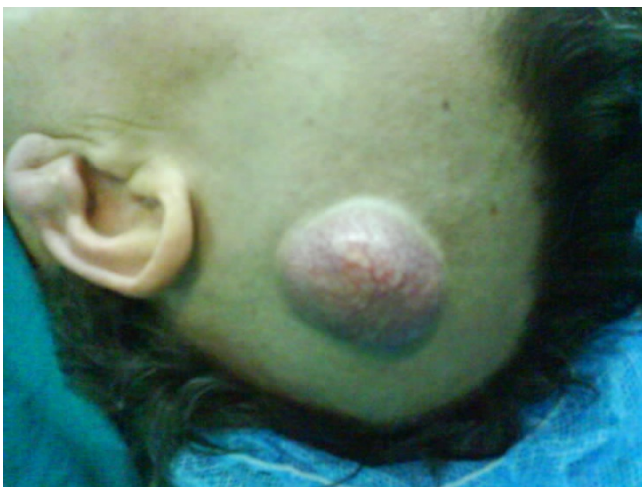
Figure 1 Clinical examination revealed a nodule on the skull skin.

The patient remained asymptomatic for 2 years postoperatively. During regular follow up, computed tomography demonstrated a suspicious lung lesion. Clinical examination also revealed a nodule measuring 4 × 4 cm on the skull skin of the left temporal lobe (Figures 1, 2). Therefore under general anesthesia, she underwent video-assisted thoracic surgery for the pulmonary nodule (wedge resection) and excision biopsy of the cutaneous lesion at the same time. Both of them were diagnosed as metastases from uterine leiomyosarcoma. The excised skin nodule revealed a proliferation of atypical spindle cells with a woven, palisading and rosette-forming pattern surrounded by fibrocollagenous tissue, with a high mitotic ratio (Figures 3, 4). Further immunohistochemical staining was positive for desmin and vimentin and this confirmed the diagnosis. The patient was referred for