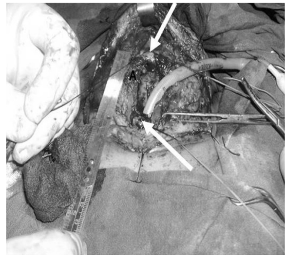
Figure 1 Distance between two end of trachea after posterior and anterior release and suprahyoid muscle cutting (A).

This study was accomplished in 20 patients. (Table 1 shows patients' characteristics). Prolonged intubation due to head injuries was the etiology of tracheal stenosis in all patients. All patients were discharged from ICU