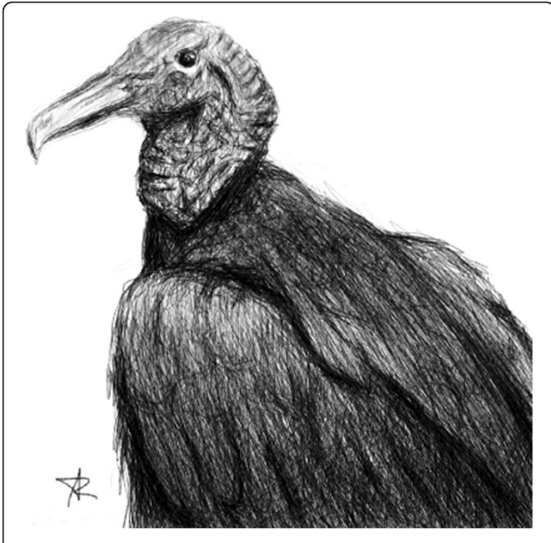
Figure 1 American Black Vulture. American Black Vulture ( Coragyps atratus ). Illustration by RSP.

Use of the Black Vulture in medicine dates back to the Roman Empire, when it was mentioned as a health treatment in texts such as Naturalis Historia, written by naturalist and philosopher Pliny the Elder [3]. Currently, this species has not been widely studied in basic and clinical research on human health [4]. However, in the area of complementary and alternative medicines (a group of medical systems and health care that is not considered part of conventional medicine, is not systematically taught in medical schools, and is not available in official health care systems [5]), the use of the American Black Vulture has been reported for the treatment of cancer patients. In a prevalence study performed at the Instituto Nacional de Cancerología (National Cancer Institute) in Colombia, 73.5% of 264 people surveyed reported to have used some type of complementary and alternative medicine for cancer treatment, and 2.2% of those surveyed had used Coragyps atratus for treating the disease [6]. In international literature, articles on the use of the American Black Vulture or other similar species in cancer are scarce [7,8].