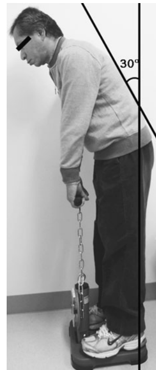
Fig. 2 Back muscle strength was determined in a standing posture with 30° lumbar flexion using a back muscle strength meter

Physical characteristics were determined by experienced interviewers using a questionnaire at the time of the Comprehensive Health Examination. Information on gender, age, BMI, FSSG questionnaire, number of oral drugs taken per day, intake of NSAIDs, intake of bisphosphonates,