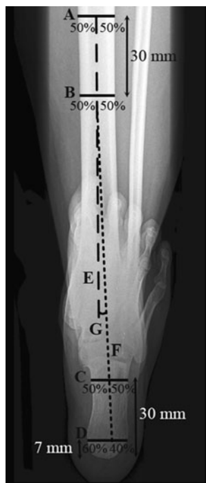
Fig. 4 Measurement method for the long axial view. We defined the mid-diaphyseal axis of the tibia by bisecting the tibia into two mid-diaphyseal points ( lines A and B ) 30 mm apart and extending the line distally ( line E ). The mid-diaphyseal axis of the calcaneus is defined by a line through two points in the calcaneus. At a distance of 7 mm from the most distal part of the calcaneus, a horizontal line is drawn ( line D ). Line D is divided into a 40%:60% ratio, where the length of the 40% line is measured from the lateral side. A second line ( line C ) is drawn horizontally, 30 mm from the most distal part of the calcaneus. The calcaneus axis ( line F ) is drawn by connecting the 40% mark at line D and the bisected line C. The hindfoot angle ( G ) is the angle between lines E and F

calcaneus axis was drawn by a line connecting the 40% mark at the first level and the bisecting mark at the second level.