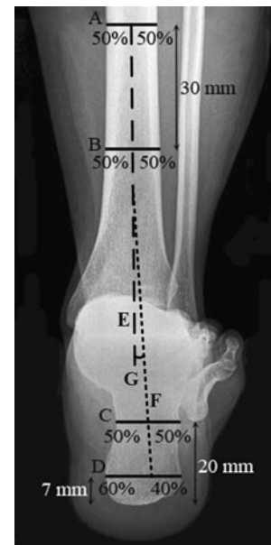
Fig. 3 Measurement method for the hindfoot alignment view. We defined the mid-diaphyseal axis of the tibia by bisecting the tibia into two mid-diaphyseal points ( lines A and B ) 30 mm apart and extending the line distally ( line E ). The mid-diaphyseal axis of the calcaneus is defined by a line through two points in the calcaneus. At a distance of 7 mm from the most distal part of the calcaneus, a horizontal line is drawn ( line D ). Line D is divided into a 40%:60% ratio, where the length of the 40% line is measured from the lateral side. A second line ( line C ) is drawn horizontally, 20 mm from the most distal part of the calcaneus. The calcaneus axis ( line F ) is drawn by connecting the 40% mark at line D and the bisected line C. The hindfoot angle ( G ) is the angle between lines E and F

longitudinal axis of the tibia) and varus (the most distal part of the calcaneus was located medial to the longitudinal axis of the tibia). For the planning of corrective treatment, it is more desirable to determine a quantitative angle of malalignment. Therefore, an angular measure of the mid-diaphyseal line of the tibia to the mid-diaphyseal line of the calcaneus was chosen, which is also frequently suggested in the literature [11, 16, 20, 24]. To determine the mid-diaphyseal line of the calcaneus, we applied the 40–60% division based on the description by Robinson et al. [25]. Using this radiographic measurement, we expected that the calcaneal mid-diaphyseal line could be determined more accurately. As this description was incomplete, a fixed definition was set for the levels at which the marks for the calcaneus axis had to be drawn. At a distance of 7 mm from the most distal part of the calcaneus, a horizontal line was drawn (Figs. 3 and 4). The width of the calcaneus at this level was divided into a 40%:60% ratio, where the length of 40% extended from the lateral side. A second line was drawn horizontally at 20 mm from the most distal part of the calcaneus in the hindfoot alignment view (Fig. 3) and 30 mm in the long axial view (Fig. 4). The width of the calcaneus at this second level was bisected equally. The