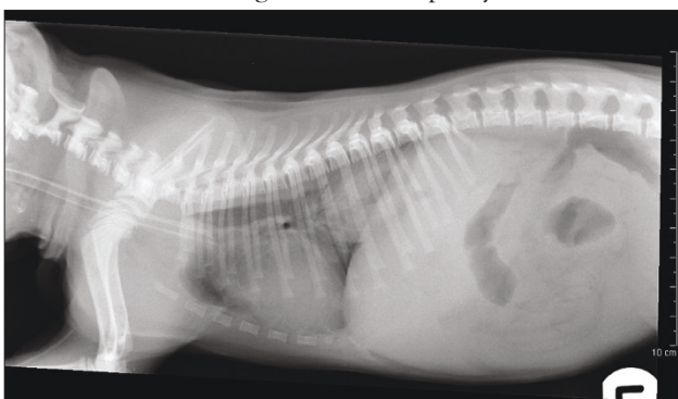
Figure 2: Left lateral thoracic radiograph demonstrating an oval soft tissue opacity in the caudodorsal thorax. The opacity extends cranially to the level of the heart base. The thoracic oesophagus is mildly distended and gas filled.

The puppy was sedated with 3 mg/kg pethidine (Pethidine, Antigen Pharmaceuticals) and 0.25 mg/kg midazolam (Hypnovel, Roche) intramuscularly for radiographic investigation. Full body, lateromedial and ventrodorsal radiographs (Figure 2 and 3) demonstrated an oval soft tissue opacity in the midline of the caudodorsal thorax superimposed on the diaphragm, causing border effacement with the right crus. The opacity extended